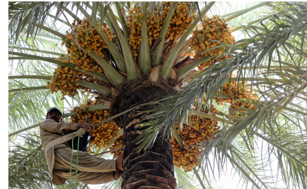
A worker collects dates from a palm tree during Unaizah Season for Dates, capital of Al-Qassim region, Saudi Arabia, August 15, 2020.

Even as they make heavy investment in tourism projects, including in remote areas, Gulf governments will need to ensure they do not lose sight of a camping tradition that celebrates a shared heritage tied to the region's wild places.