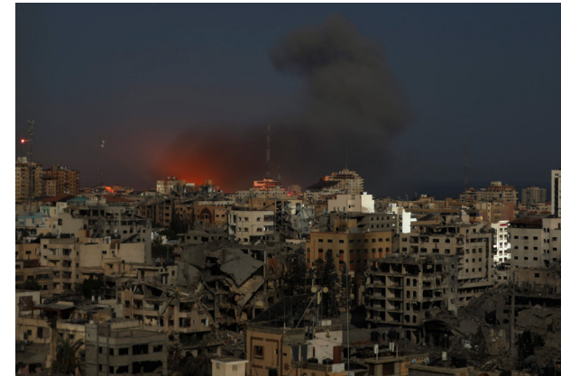
Long exposure photo shows destroyed buildings with fire and smoke rising following Israeli airstrikes on Gaza City, Oct. 30, 2024.

While underscoring the EU's ambitions to expand its maritime security goals in the region, Operation Aspides faces operational and political challenges.