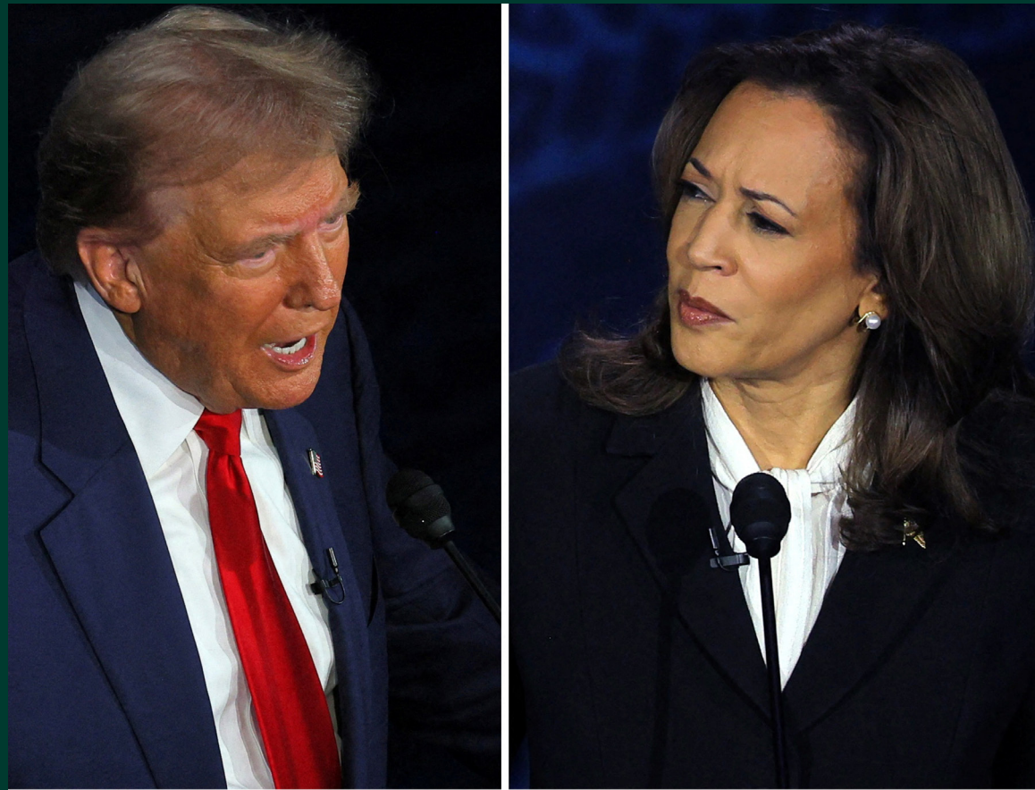
Republican presidential nominee former President Donald J. Trump and Democratic presidential nominee Vice President Kamala Harris take part in a presidential debate hosted by ABC in Philadelphia, Pennsylvania, September 10, 2024, in a combination of file photographs.