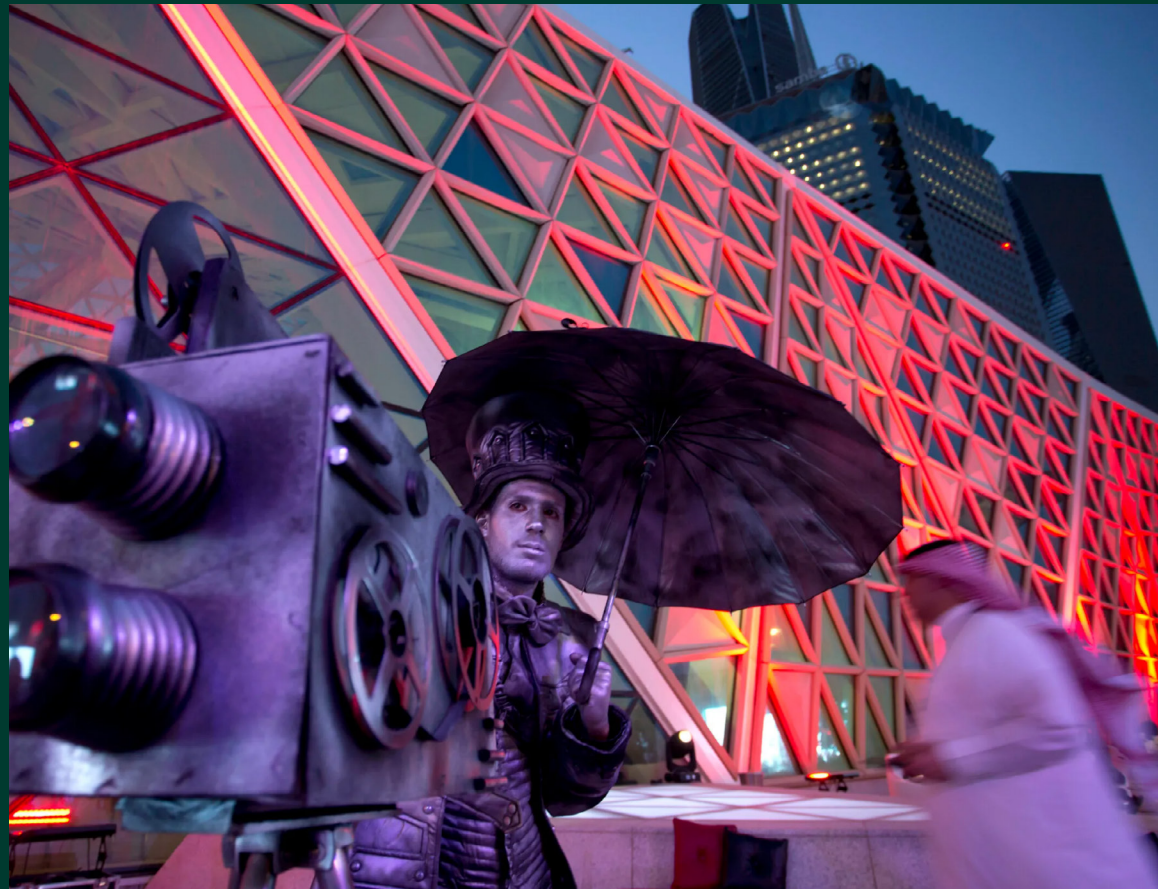
An actor poses with a replica of a vintage cinema camera as visitors enter an invitation-only screening at the King Abdullah Financial District Theater, in Riyadh, Saudi Arabia, April 18, 2018.