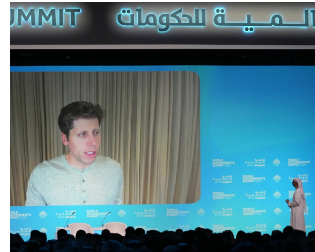
OpenAI CEO Sam Altman talks on a video chat during the World Government Summit in Dubai, UAE, Feb. 13, 2024.

Bahrain's post-coronavirus economic strategy positions the government as a venture capitalist, providing capital for strategic investments, but at the same time offering regulatory support for the private sector.