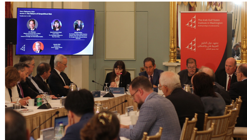
Panel at AGSI's 2024 Petro Diplomacy conference. (AGSI)