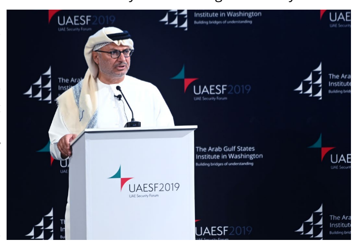
Anwar Gargash, Minister of State for Foreign Affairs, United Arab Emirates

While Saudi Arabia is trying to diversify its economy by implementing its Vision 2030 reform agenda, stability on the other side of