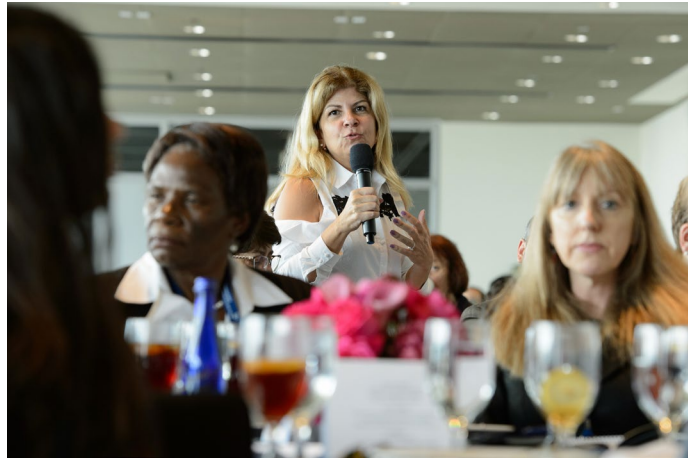
An audience member asks a question during the Q&A session.

A: Iran is an important country; it's a big country, for sure, but the current regime has left very little room for dialogue. Saudi Arabia and Iran had a very strong relation, a good relationship before 1979. After 1979, there have been several attempts at dialogue between the kingdom and Iran. Some of them worked temporarily, but in the end, they always fail because of Iran's tendency to want to export the revolution, want to impose its will on the region, and that makes it very difficult. You know, are there prospects for dialogue in the future, is Iran going to change, are they going to change their constitution where they no longer make export of the revolution a part of their national principles? I don't know. I would hope that Iran would moderate and then be a worthy partner for dialogue, but at the current time, it doesn't seem so.