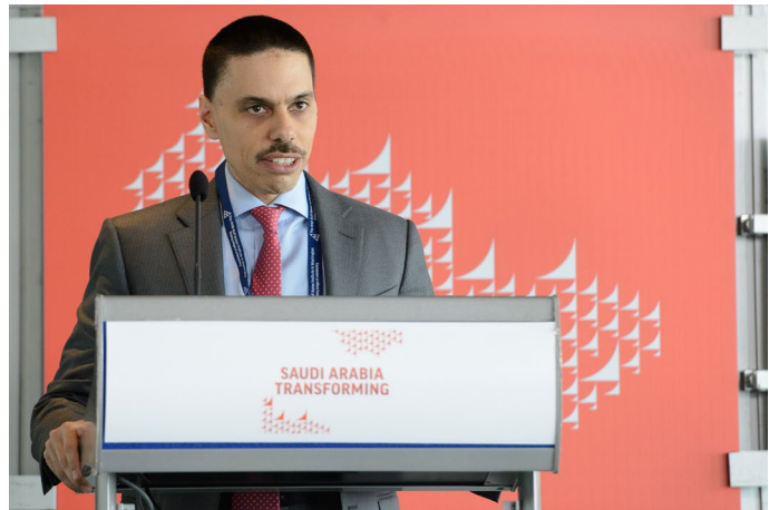
H.H. Faisal Bin Farhan Al Saud, Advisor, Ministry of Foreign Affairs, Kingdom of Saudi Arabia

As we diversify the economy, we intend to triple non-oil revenue to $141 billion by 2020, and create 450,000 new nongovernmental jobs. And, as we introduce policies to empower the private sector, our goal is to increase its contribution to gross domestic product from 40 to 65 percent. We also intend to empower women to play a more prominent role by increasing women's participation in the workforce from 22 to 30 percent among other goals. Ten years ago, seeing women participate in government meetings was uncommon. Today, when I go to meetings at government agencies, I am more likely than not to see several women participating in the decision-making process.